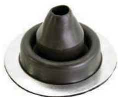
Solar Flash Master Flash®