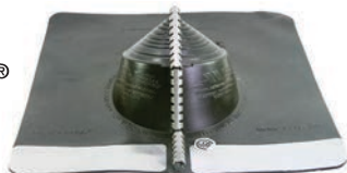
Electrical Mast Connection (EMC) Master Flash®