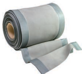
Stretchable Linear Flash (SLF) Master Flash®