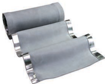
Box Gutter Expansion Joint Master Flash®