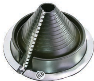
Retrofit Universal (Round Base) Master Flash®